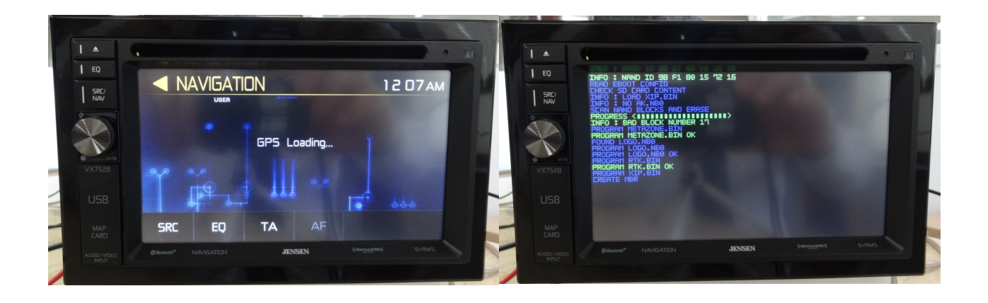
Turn off ACC and remove the Navigation SD card and insert the SD with the update files. Turn on ACC and select the Navigation. Wait for the files to load and update.